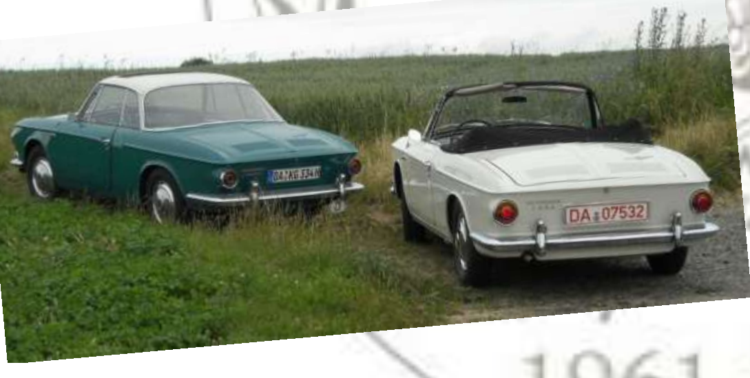
As of mid-January there are 44 T34s registered for the event. Only 50 is needed to set a new world record.

www.50-jahre-typ-34.de/registrierung/nennung english.pdf